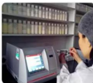
Density refracton all in one machine