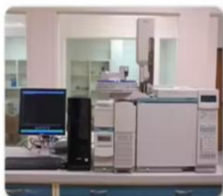
Agilent GC / MS