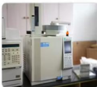
Shimadzu gas chromatograph