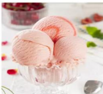
Ice Cream Flavor