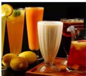
Beverage & Milk Flavor