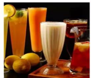
Beverage & Milk Flavor