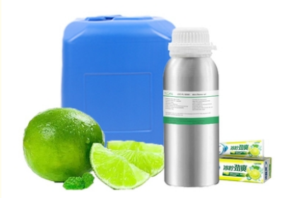
Lemon Fragrance LDZ-PL90005