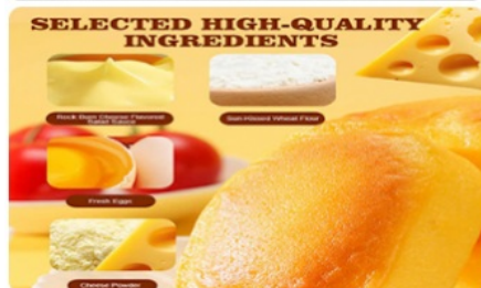
SELECTED HIGH-QUALITY INGREDIENTS