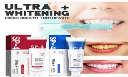
ULTRA + WHITENING FRESH BREATH TOOTHPASTE