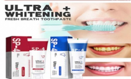
ULTRA + WHITENING FRESH BREATH TOOTHPASTE