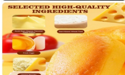
SELECTED HIGH-QUALITY INGREDIENTS