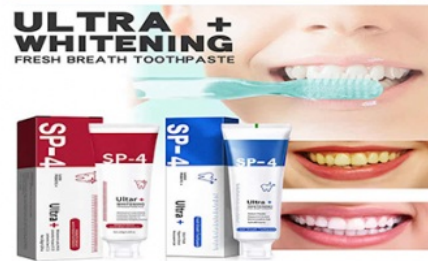
ULTRA + WHITENING FRESH BREATH TOOTHPASTE