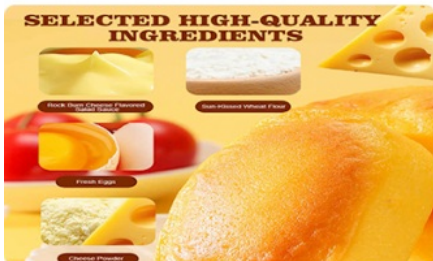
SELECTED HIGH-QUALITY INGREDIENTS