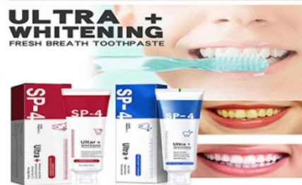
ULTRA + WHITENING FRESH BREATH TOOTHPASTE