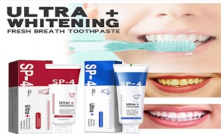
ULTRA + WHITENING FRESH BREATH TOOTHPASTE