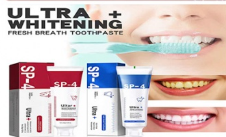
ULTRA+ WHITENING FRESH BREATH TOOTHPASTE